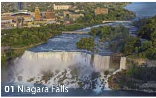
01 Niagara Falls