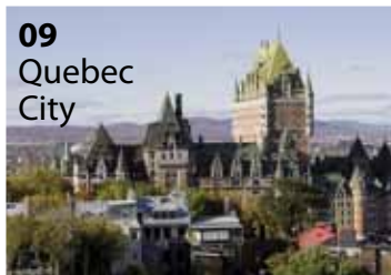
09 Quebec City