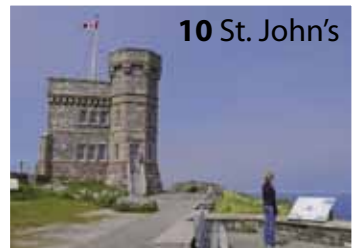
10 St. John's